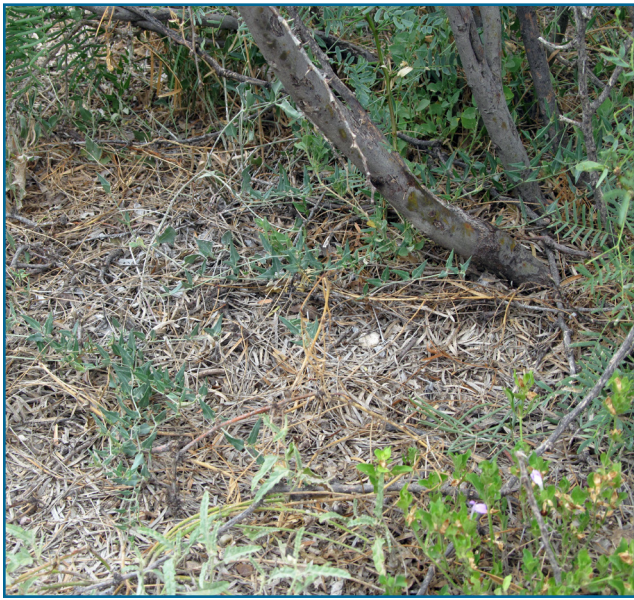
Figure 2. Litter layer composed of dead leaves, twigs, and dung.

fine-textured soils that have little or no vegetation. While soil crusting reduces rainfall infiltration, it also reduces erosion. This is also true of rain falling on bare soil after a prolonged dry period, even in unburned pastures.