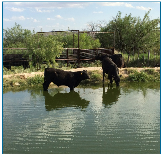
Figure 1. Livestock in a stock tank in Pecos County, Texas.

Reduced plant cover leaves the soil vulnerable to increased rainfall runoff and soil erosion. If not prevented, the increased erosion can continue to deteriorate the pond or surface water quality.