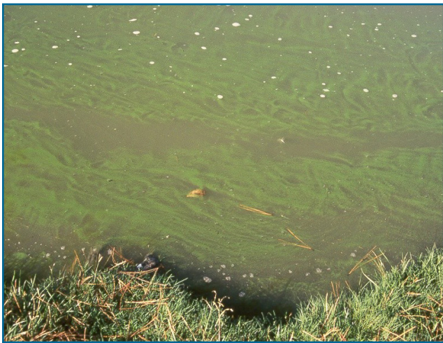
Figure 4. Bright green cyanobacteria floating on a pond surface.