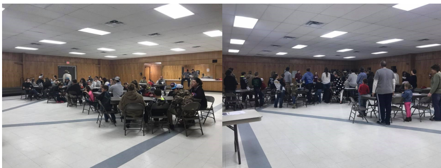
Barbers Hill 4-H Club members learn about the importance of family meals.